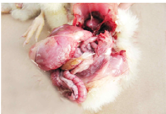
Fig. 3. Photograph of the chicken embryo treated with the triaminohexanoic acid solution into the yolk sac. A normal structure of the internal organs is seen.

Pathological evaluation of the internal tissues has been revealed that all organs were normal in group 1. In embryos of group 2, which received the triaminohexanoic acid solution, all gross structures were also normal (figures 3-6).