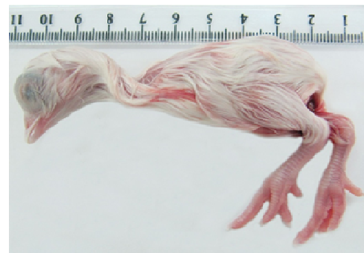
Fig. 1. The chicken embryo treated with the phosphate buffered saline solution into the yolk sac. The embryo is normal with no gross lesions.

The tissues of the embryos were normal in group 1 (figure 1). In triaminohexanoic acid-injected group, group 2, there was not any gross abnormality in the external tissues and external body surfaces (figure 2).