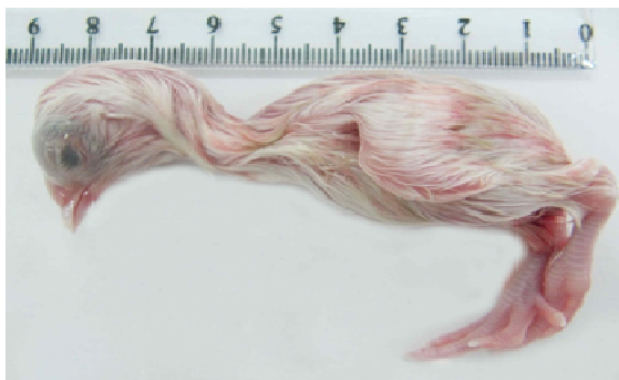
Fig. 2. The chicken embryo treated with the triaminohexanoic acid solution into the yolk sac. The embryo is normal with no gross lesions.