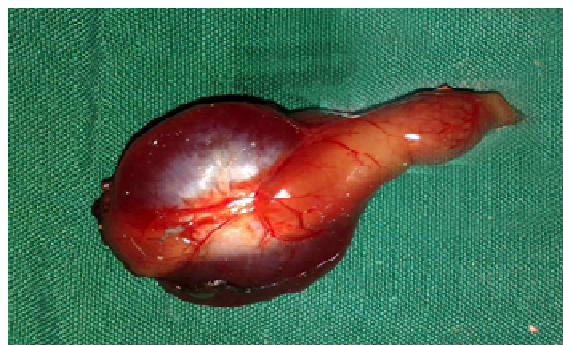
Fig. 5. Photograph of the chicken embryo treated with the triaminohexanoic acid solution into the yolk sac. The normal structures of the proventriculus and ventriculus are seen.