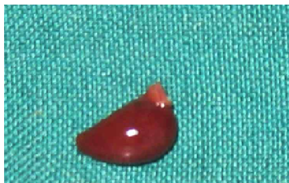
Fig. 6. Photograph of the chicken embryo treated with the triaminohexanoic acid solution into the yolk sac. The normal structure of the spleen is seen.