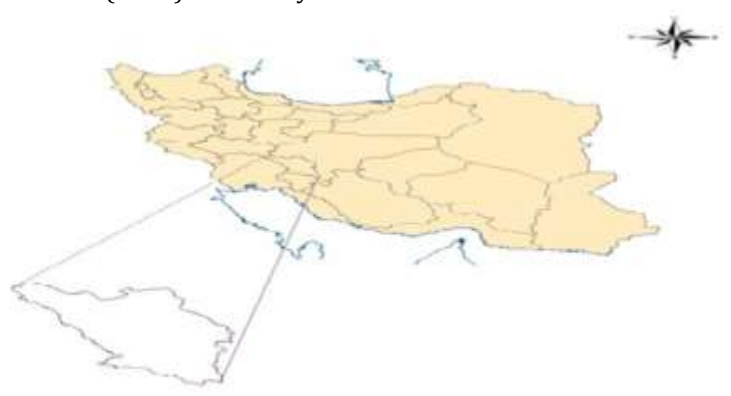
Figure 1. The geographical position of Chaharmahal O Bakhtiari province in Iran

Chaharmahal O Bakhtiari province with an area 16532 km² is located between the 31° 9′ to 32° 48′ northern latitude and 49° 28′ to 51° 25′ eastern longitude. This province is located in central parts of Zagros mountain between the within mountains and Esfehan province. It is limited to Esfehan province in north and east direction, Khozestan province from west and Kokuloyeh O Boier ahmad from south and Lorestan from west.