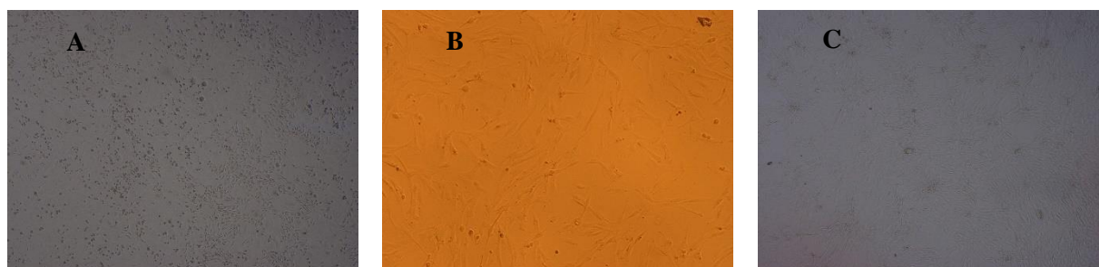
Figure 1. Human amnion membrane-derived mesenchymal stem cells (hAMSCs); A, on day 14 (initial cultivation); B, on passage 1; C, on passage 6

In this study, Mesenchymal stem cells were successfully isolated and cultured from the human amniotic membrane. The observations showed early cells that were seen small, spherical and floating in the culture medium, and began to adhere to the bottom of the flask after two days of culture. A uniform spindle-like population of mesenchymal stem cells similar to fibroblast cells was observed after about 5-6 days of culture. These cells were appeared on the bottom of the flask and reached 80% confluency during 14 days of culture (Figure 1A). With each change of medium and passage, the purity of the spindle cells (AMSCs) increased. Passage of cells up to sixth passage was performed to evaluate stability of cells and no change in cell shape was observed (Figure 1C).