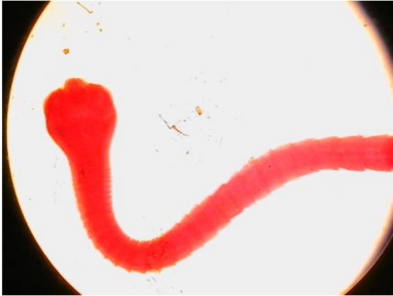
Figure 3: Raillietina Cysticylus in intestine of quails was smeared with Acetocarmen