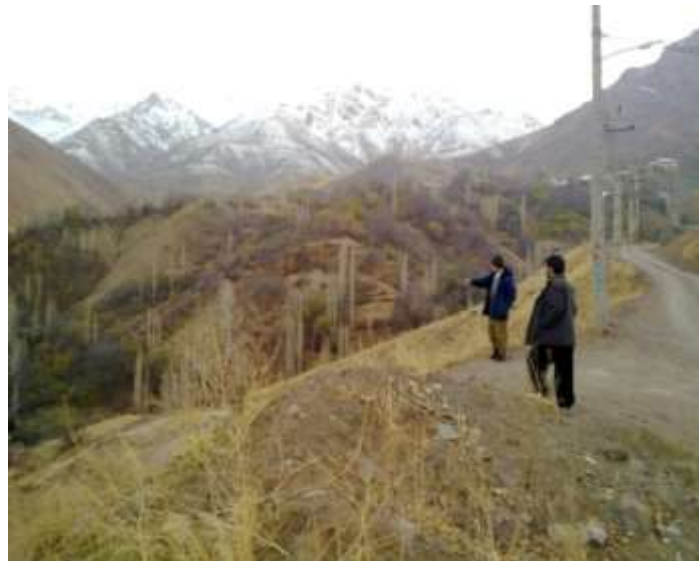
Figure 2: Visits to this area (outman, 2010)