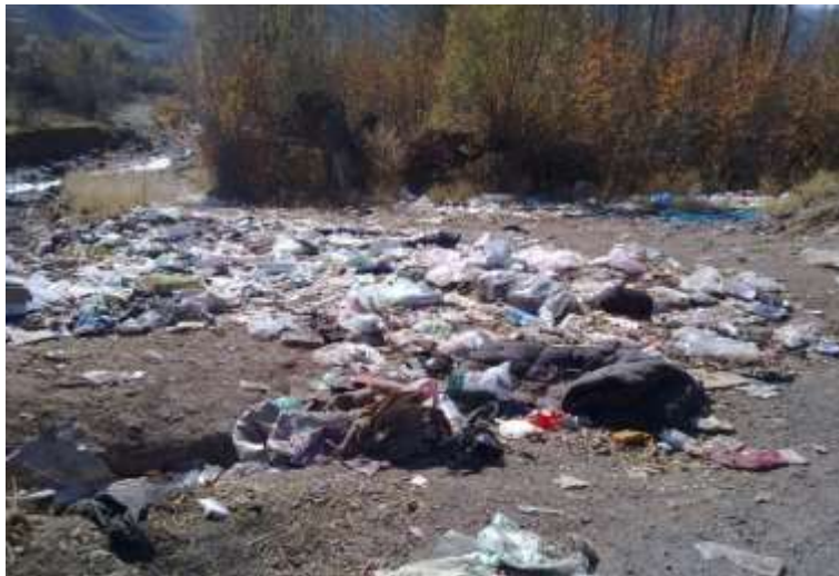
Figure 5: Trash along the river and the regional health planning

The Percentage of Landscape metrics showed that the garden area was increased by 2.28 percent, while agricultural land was decreased by 15.5 percent. Grasslands increased 16.25 percent and bare lands to 28.08 percent (Fig. 6). From the ecological concept, due to the increasing surface area of the bare lands and decreased grasslands, it can be concluded that vegetation cover was destroyed. But agriculture land decreased intensely; it can be caused by the existence of the Taleghan reservoir and more can be caused by the release of the dry plains which these lands were converted to pastures over time with weak density.