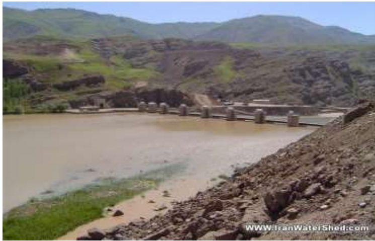
Figure 4: Dam Taleghan