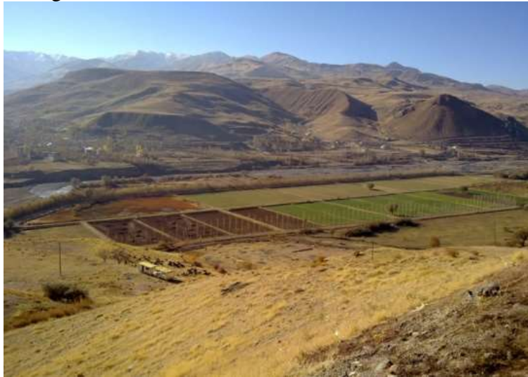
Figure 3: Agricultural land of area Taleghan

Taleghan area due to differences in altitude and topographical diversity, 510 plant species, including 30 species of medicinal, 22 types of grassland and Different communities and Shrubs such as juniper, beech, oak, mastic, oak, hawthorn and... (Nikcar, 2011). Figure 3 indicated Agricultural land of Taleghan area.