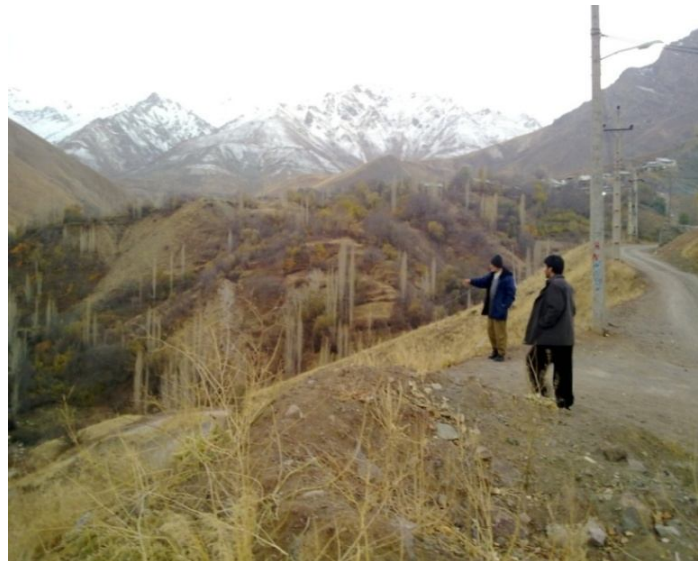
Figure 2: Visits to this area (outman, 2010)