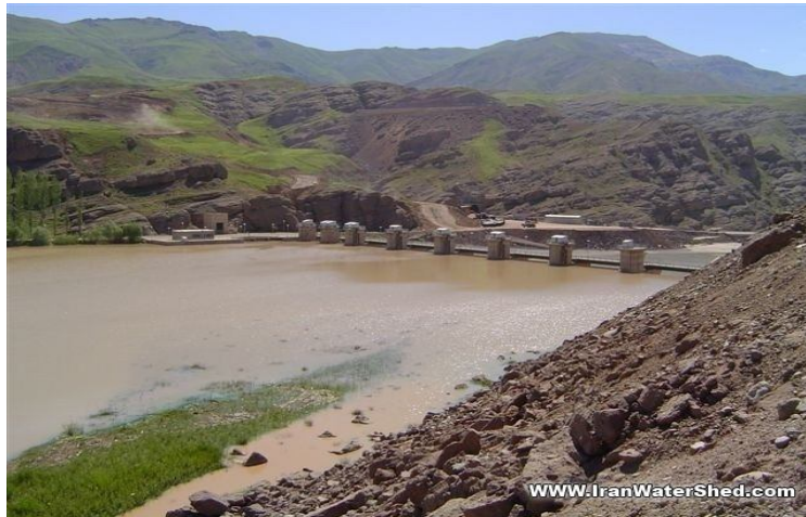
Figure 4: Dam Taleghan