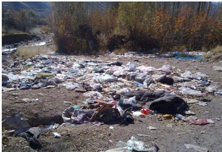
Figure 5: Trash along the river and the regional health planning

The Percentage of Landscape metrics showed that the garden area was increased by 2.28 percent, while agricultural land was decreased by 15.5 percent. Grasslands increased 16.25 percent and bare lands to 28.08 percent (Fig. 6). From the ecological concept, due to the increasing surface area of the bare lands and decreased grasslands, it can be concluded that vegetation cover was destroyed. But agriculture land decreased intensely; it can be caused by the existence of the Taleghan reservoir and more can be caused by the release of the dry plains which these lands were converted to pastures over time with weak density.