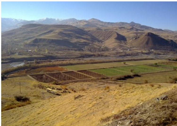
Figure 3: Agricultural land of area Taleghan

Taleghan area due to differences in altitude and topographical diversity, 510 plant species, including 30 species of medicinal, 22 types of grassland and Different communities and Shrubs such as juniper, beech, oak, mastic, oak, hawthorn and... (Nikcar, 2011). Figure 3 indicated Agricultural land of Taleghan area.