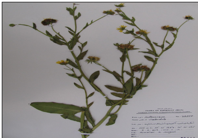
Fig1. Calendula karakalensis