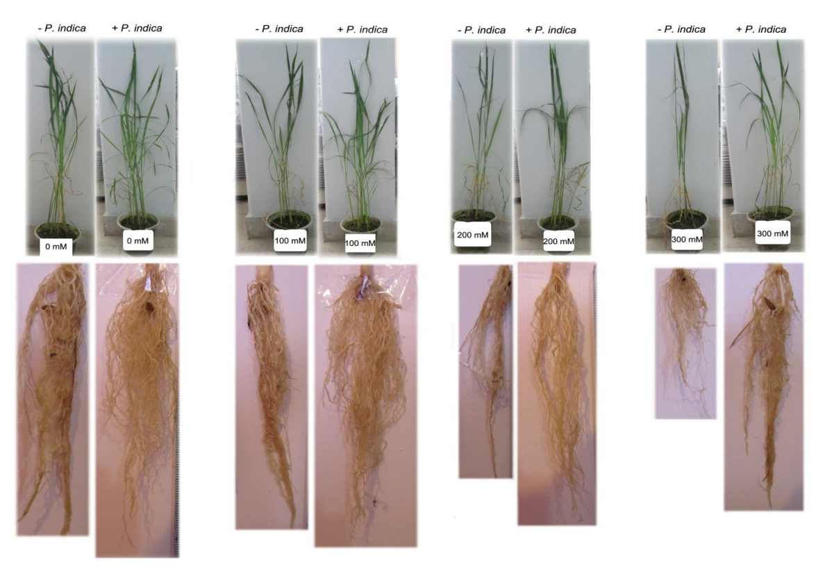
Fig 2. Effects of P.indica on root and shoot morphological of rice plant under salt stress.