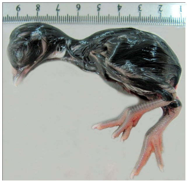
Fig. 2. The chicken embryo treated with florfenicol injectable solution into the yolk sac. The embryo is normal with no gross lesions.