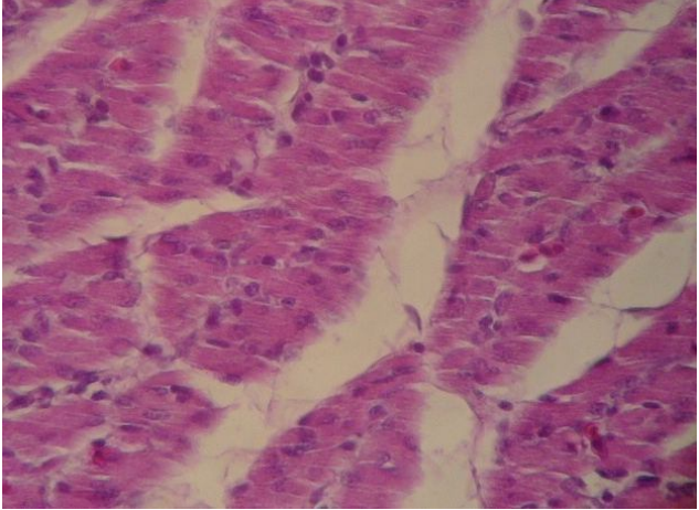
Fig. 5. Photomicrograph of the chicken embryo treated with florfenicol injectable solution into the yolk sac. The normal structure of the muscle is seen. \times 400 H&E

Fig. 4. Photomicrograph of the chicken embryo treated with florfenicol injectable solution into the yolk sac. A normal kidney tissue is seen. \times 100 H&E