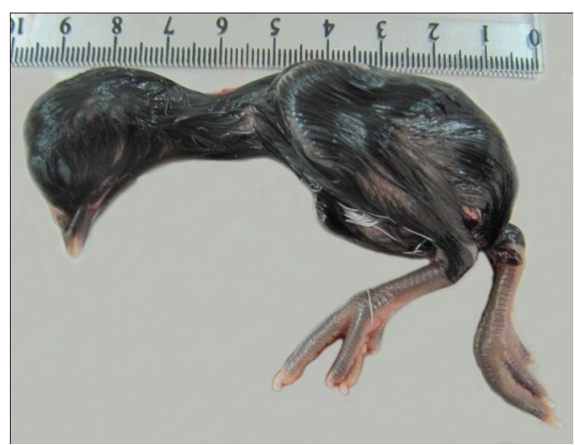
Fig. 1. The chicken embryo treated with phosphate buffered saline solution into the yolk sac. The embryo is normal with no gross lesions.

The tissues of the embryos were normal in groups 1 and 2 (figure 1). In florfenicol-injected groups (groups 3 and 4) there was not any gross abnormality in the tissues and external body surfaces (figure 2). The obtained tissue samples of these embryos were sent to the pathology laboratory.