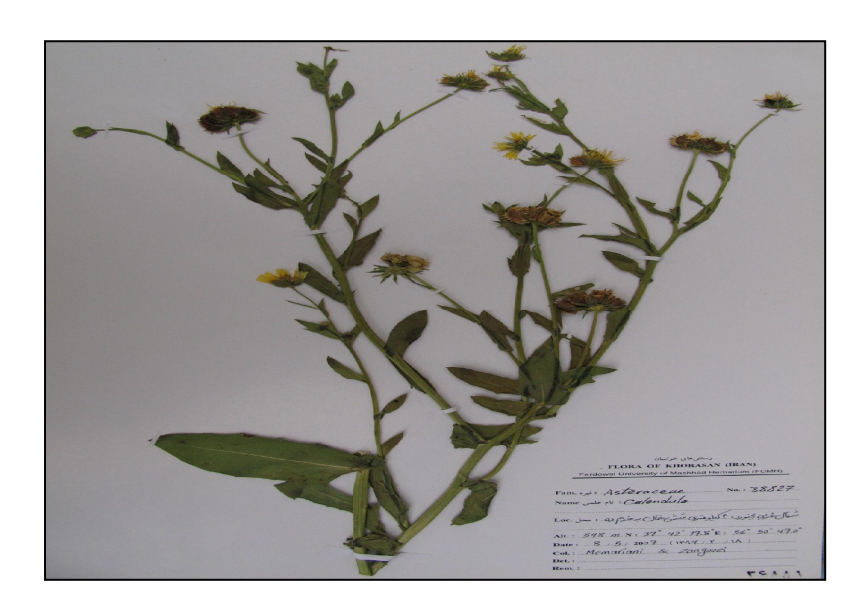
Fig1. Calendula karakalensis